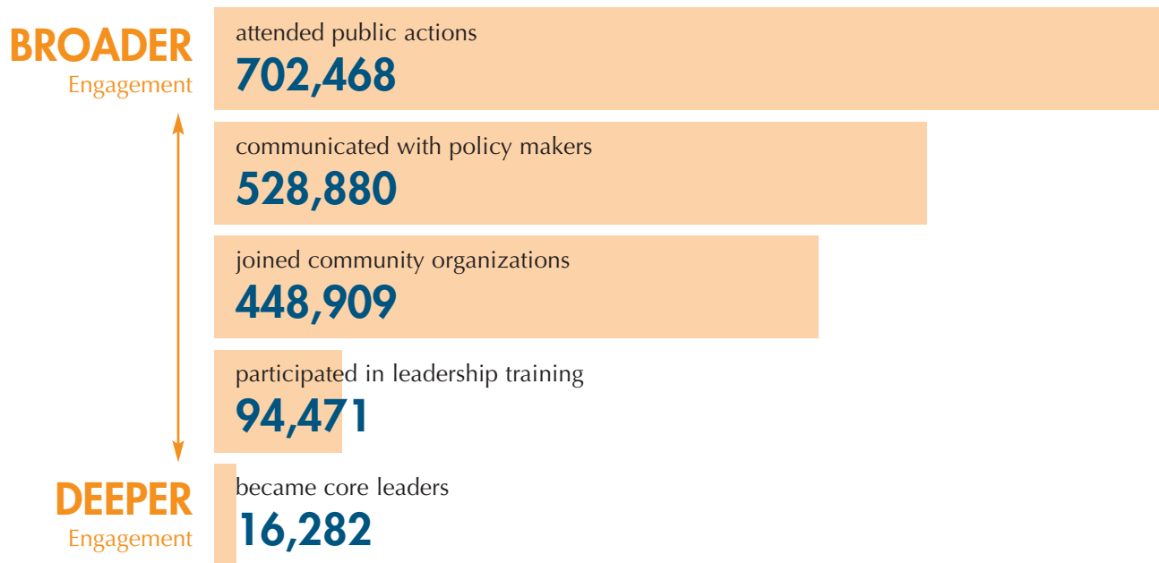
FIGURE 2: SUMMARY OF CIVIC ENGAGEMENT FINDINGS OVER FIVE YEARS

The sample nonprofits viewed civic engagement as both a strategy to achieve policy change and a valued outcome in itself. In our study sites alone, at least 700,000 residents – more than can fit in the seven largest football stadiums at once – were given the opportunity to voice their concerns publicly, and many more were reached through newsletters, radio shows and other means of communication. The 44 nonprofits that reported voter engagement data registered more